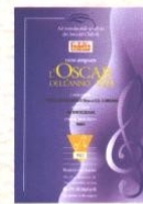
Oscar del Suono 1994